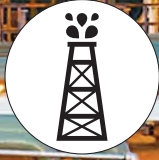
NATURAL GAS PRODUCTION AND PROCESSING