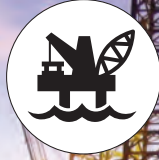
OIL PRODUCTION AND PROCESSING