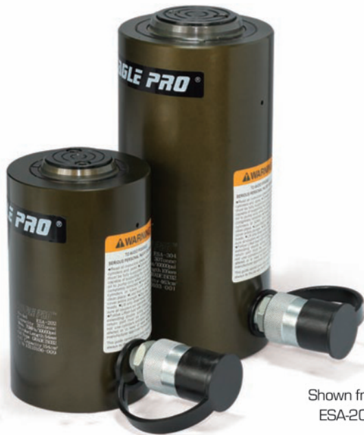
Shown from left to right: ESA-202, ESA-304