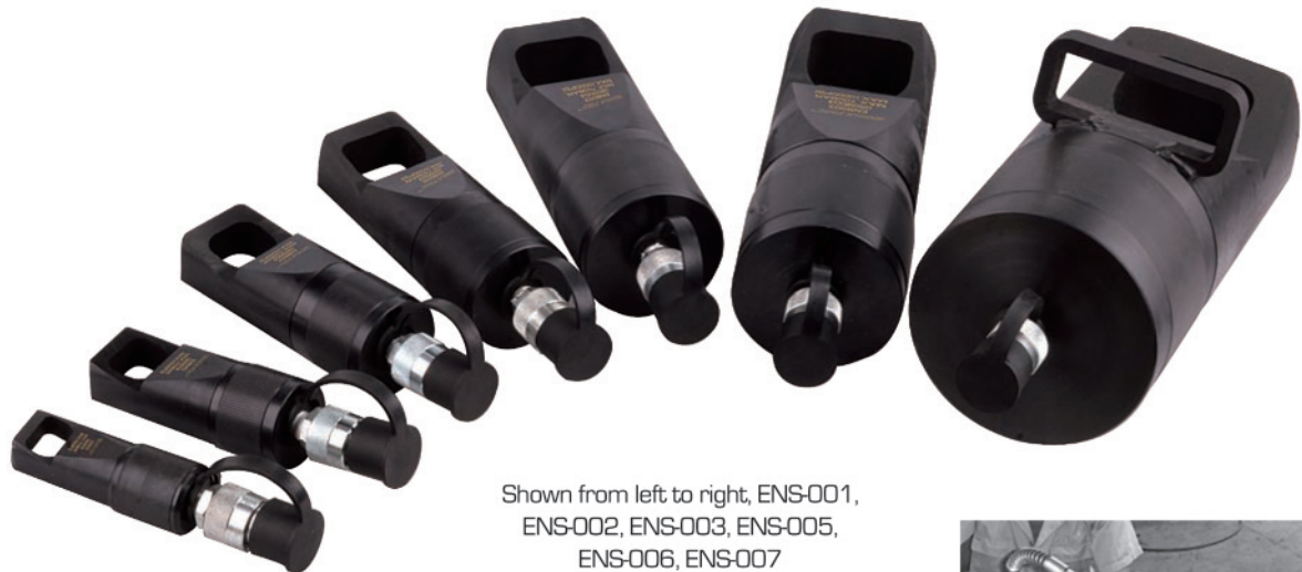
Shown from left to right, ENS-001, ENS-002, ENS-003, ENS-005, ENS-006, ENS-007