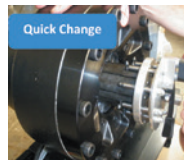
Easy positioning of fitting thanks to radial die movement