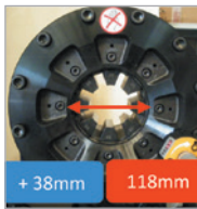
+ 38mm 118mm