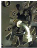
Front flange cuts allow long drop elbows