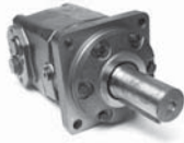
VNKT 400 [410.9cm 3 /rev.]