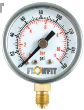
Dual scale psi (outer) in black and bar (inner) in red