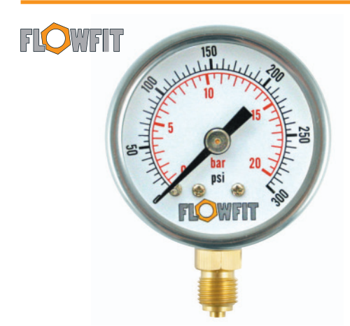
Dual scale psi (outer) in black and bar (inner) in red