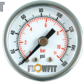
Dual scale psi (outer) in black and bar (inner) in red