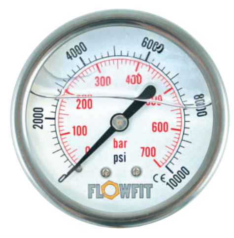
Dual scale psi (outer) in black and bar (inner) in red