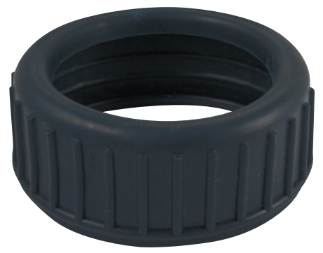
Rubber Protective Cover