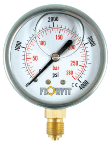
Dual scale psi (outer) in black and bar (inner) in red