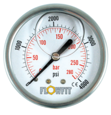
Dual scale psi (outer) in black and bar (inner) in red