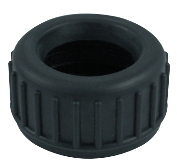
Rubber Protective Cover