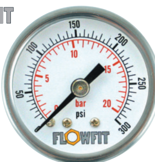
Dual scale psi (outer) in black and bar (inner) in red