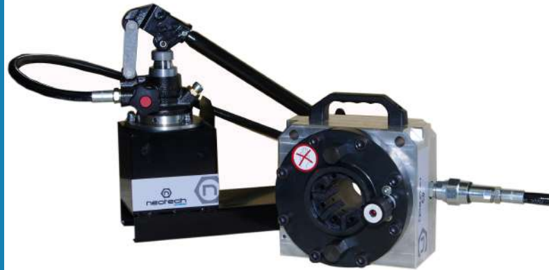
HEAD WITH MAGNETIC SIDE