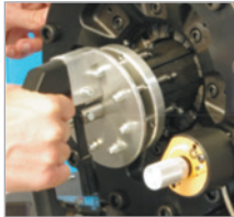
Option : QCT-NLS