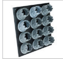
Option : WP-12PDR